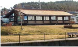
Port McNeill Where the welcome never stops.